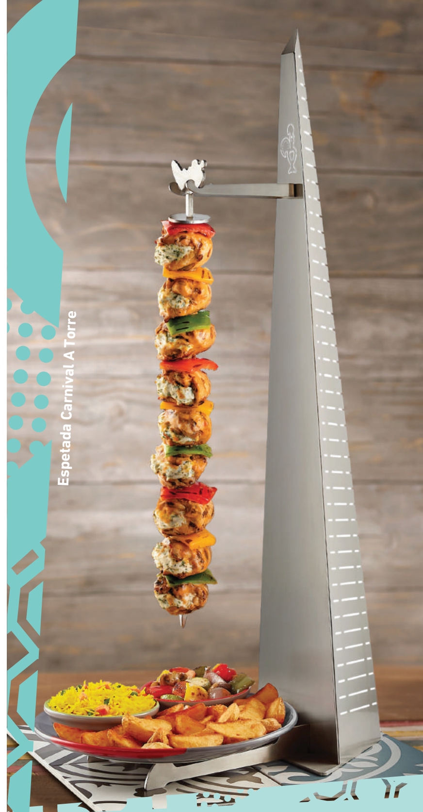
Espetada Carnival A Torre

Add 1 scoop of ice-cream with your choice of sauce for only 0.750